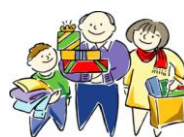
Adopt a Friend

Children’s Stewardship: Collection $ 18.90 Sharing Good Works: Helped with Friends gift (3); helped Daddy (2); helped with Christmas tree (2); Came to church; played with dog in the cold; practiced songs for choir; helped a friend; donated to charity; gave toys & clothes to poor; found money & gave to poor; cleaned the basement; helped with Christmas Friends