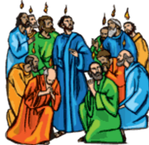
The Holy Spirit Descends on Pentecost

Second Collection – This Sunday, May 31 st , we will be taking up a second collection for Retired Diocesan Priests . This will help in providing retirement and health care for our retired Diocesan Priests. Please pray for our priests who serve so generously in various apostolates throughout our